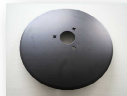
Plowing Colter blade & disk blade