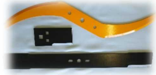
Mowing for a rotary cutting tool