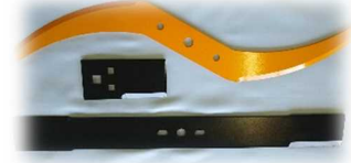
Mowing for a rotary cutting tool