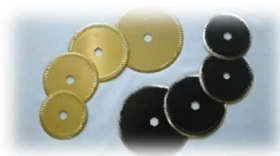
Combine blade、Straw cutting blade, straw cutter(rotary blade)